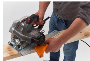
• 22.5° Angle