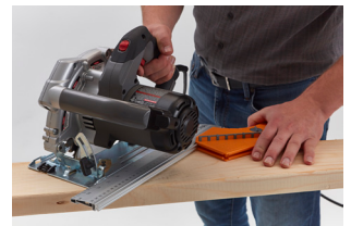
• 45° Angle