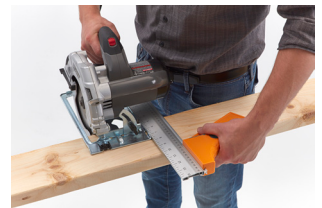
• 90° Angle