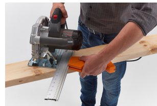
• 60° Angle